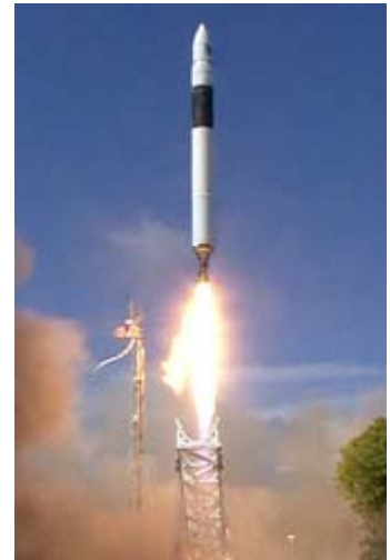
Falcon 1 Flight 3 lifts off from the SpaceX Omelek island launch site on 2 Aug 2008 (UTC).

The tanks are precision machined from plate with integral flanges and ports, minimizing the number of welds necessary. A single SpaceX Kestrel engine powers the Falcon 1 upper stage.